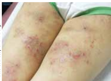
Atopic dermatitis on the legs of a 21-month-old male (top) and a nine-year-old female.