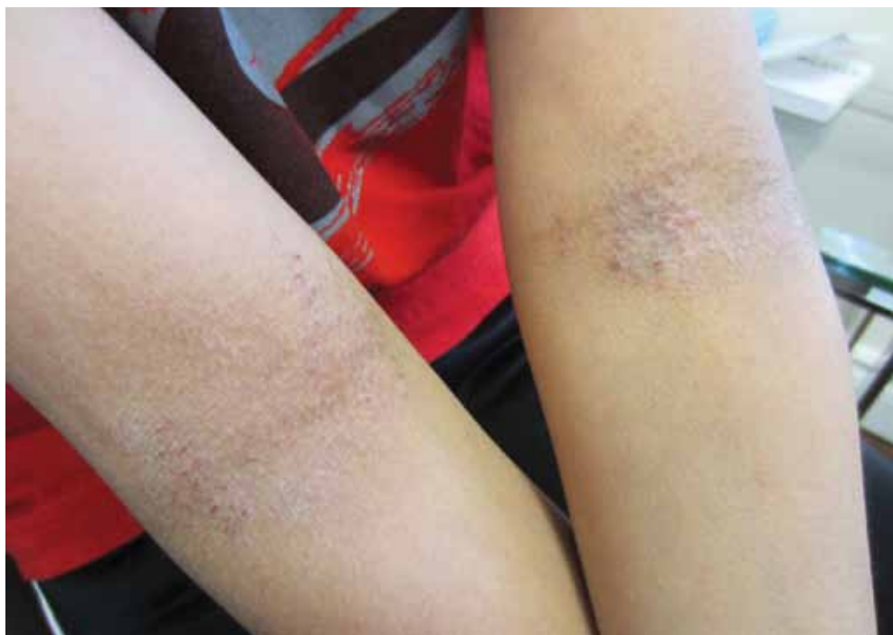
Children and their parents should be advised that atopic dermatitis is a chronic disease that requires daily treatment complemented by lifestyle changes.